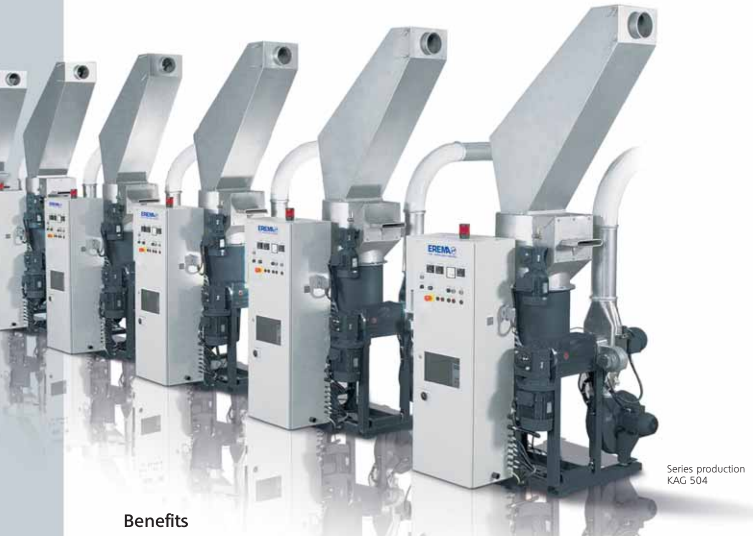
Series production KAG 504

... for fully automatic edge trim recycling.