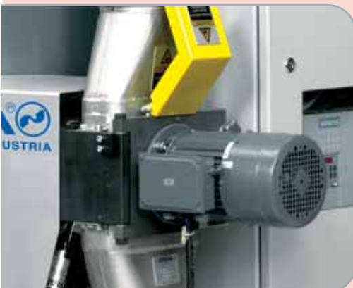
Pelletiser with air cooling

The system is not suitable for processing low viscosity "sticky" polymer melts such as PP, PET, PA and mixtures of those materials.